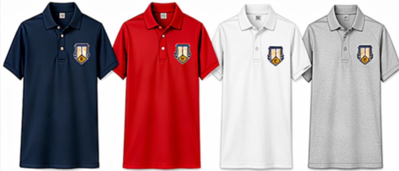
Navy Polo Red Polo White Polo Light Grey Polo