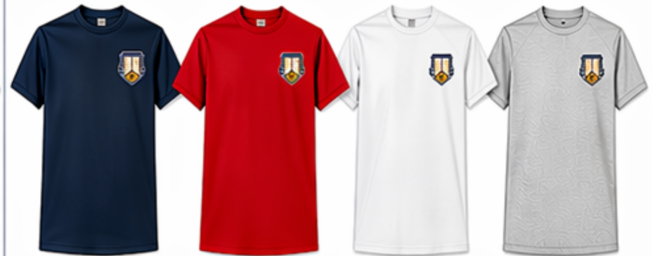
Navy T-Shirt Red T-Shirt White T-Shirt Light Grey T-Shirt

All tops must have the Cornerstone Preparatory Academy logo.