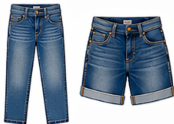
Jeans (Full Length) Jean Shorts (Appropriate Length)

Students may wear jeans or jean shorts on Fridays with approved tops.